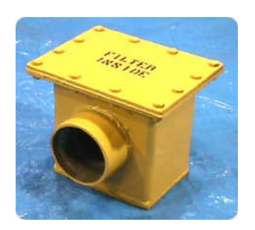
Molasses/fat strainer with removable stainless steel strainer screen. 28 pounds

Molasses/Fat continuous flow core heater with 60-250 F, thermostat in NEMA IV enclosure, 230 or 460 VAC, single or three phase, 6000 watts. 115 pounds.