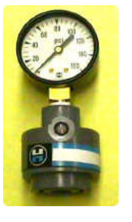
Diaphragm pressure gauge