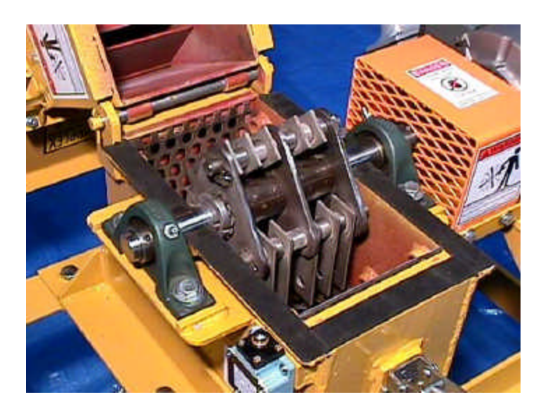
Photo shows LM6 Hammermill with 12" x 12" inlet hopper and 1-1/2 HP single phase direct connected motor operating at 3550 RPM. Hammermill is mounted on a portable stand which offers 16" discharge clearance.

Laboratory and Small Production Hammermill Bench and portable models available 1 to 5 HP, single phase or three phase Reference: Serial #69194-H15395