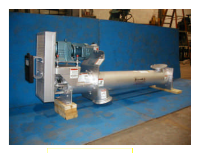
High temperature seal & bearing construction.

Special high temperature construction used on 9" inclined tube screw.